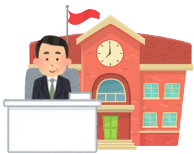
Donagh School Manager